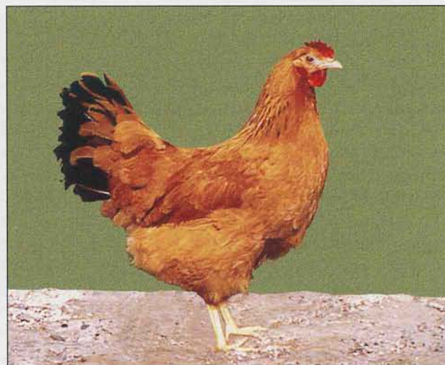
Yellow Hungarian chicken