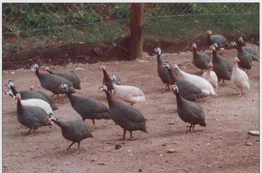
Guinea fowl (colour varieties)

The original Hungarian duck considered as an indigenous breed in the Carpathian basin used to be found mostly in white and wild, rarely in spotted, brown or black colour varieties. Because of its juicy, delicious meat, Hungarian duck was bred all over the country and was much more important for domestic consumption than goose. Nevertheless, starting with the early 1960s, the Hungarian duck gradually disappeared as the result