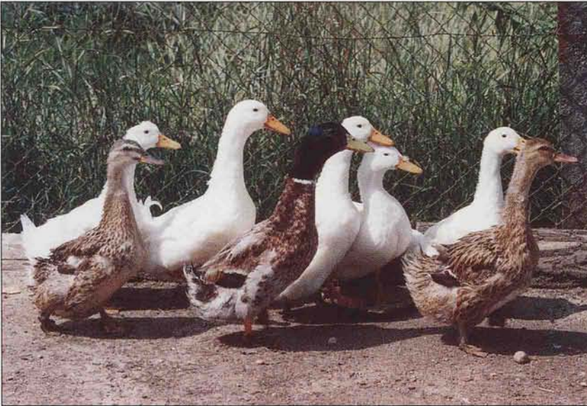
Hungarian duck (colour varieties)

middle part of the Great Hungarian Plain. Later the black variety almost disappeared after crossing with Bronze and other imported black turkey breeds at the beginning of the 20 th century. As the result of those crossings, however, the Bronze turkey became adapted to the local conditions and it is considered now as a traditional Hungarian poultry breed.