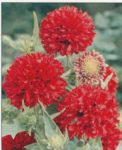
Front Cover Gaillardia pulchella 'Red Plume'