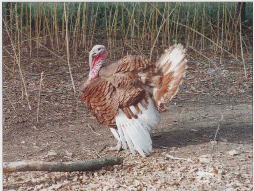
Copper turkey (male)

Báldy B. (1958) Házimadarak (Domestic birds). In: Magyarország állatvilága, XXI. kötet, Akadémiai Kiadó, Budapest