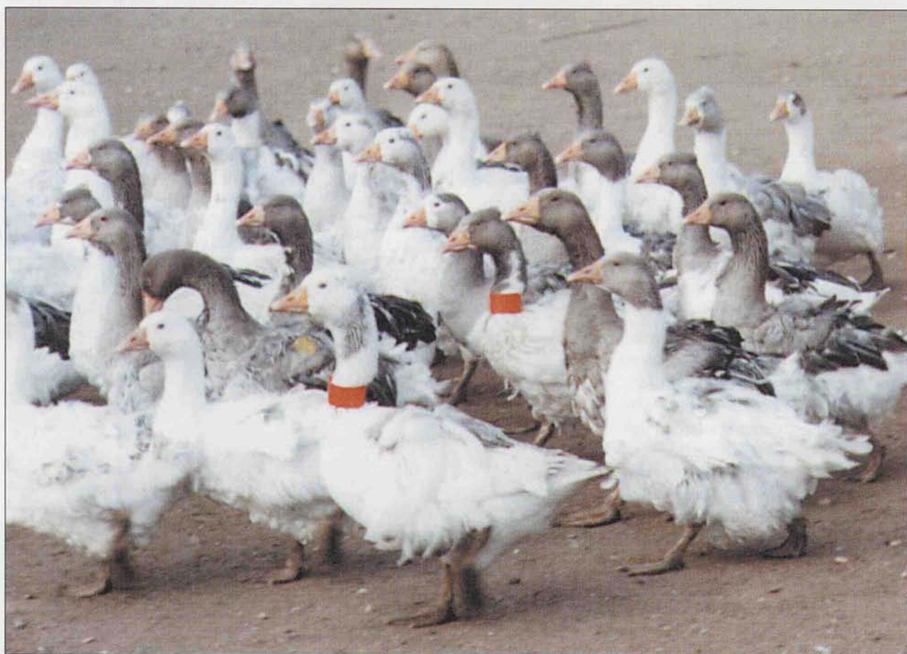
Frizzled Hungarian Goose (colour varieties)

cious poultry species to Europe as the Vikings might have done it some 1000 years ago. It is a fact however that turkey breeding has existed in the Carpathian basin for many centuries. In Hungary, two colour variants of turkey were known and bred in the 1800s: white and black Hungarian turkey. They were popular mostly in the