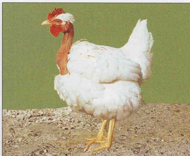
Transylvanian Naked Neck chicken (white variety)

these birds, scratching for food regardless of hot or cold weather. Beginning in the early 1960s, together with the expansion of commercial poultry breeding, Hungarian breeds were replaced by foreign hybrids of both laying and meat type chickens even on small-scale farms. Since then Hungarian and Transylvanian